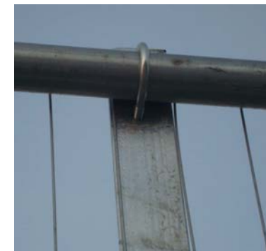
TOP U BOLT DETAIL.