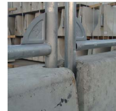
FENCE / END BARRIER DETAIL.

Wind Loading report available on request.