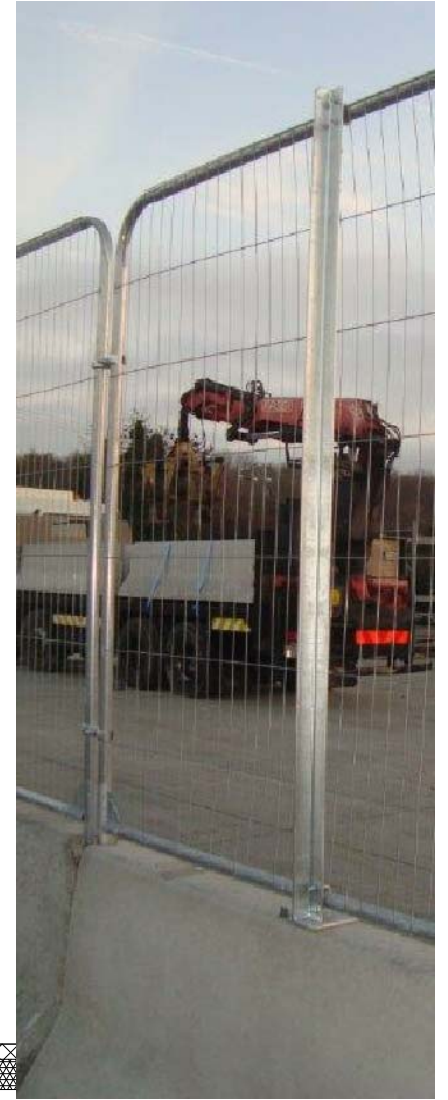
POST / FENCE DETAIL.