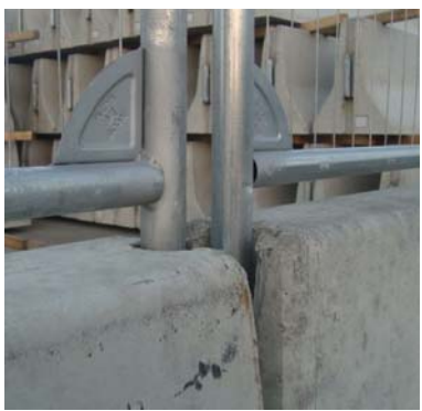
FENCE / END BARRIER DETAIL.

Note: 1. 970mm high safety fence with associated posts etc also available.