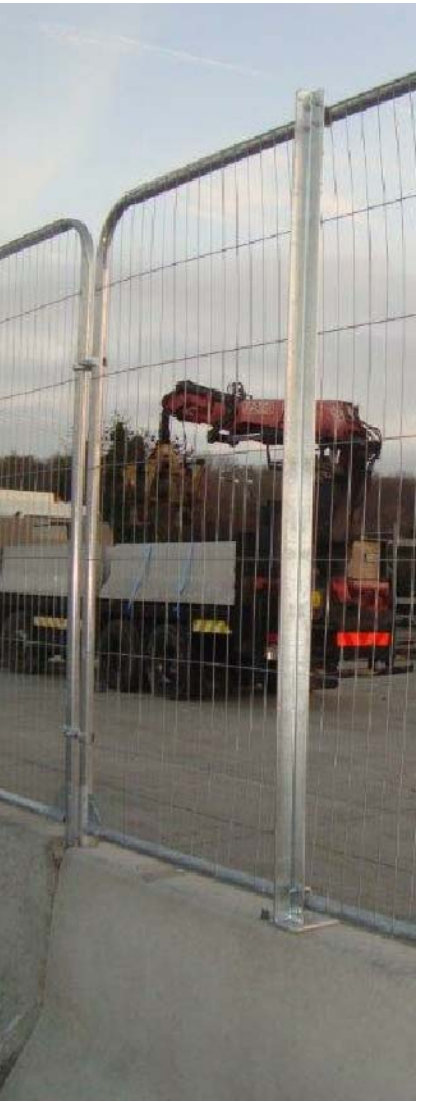
POST / FENCE DETAIL.