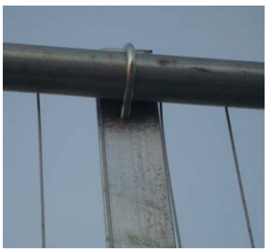
TOP U BOLT DETAIL.